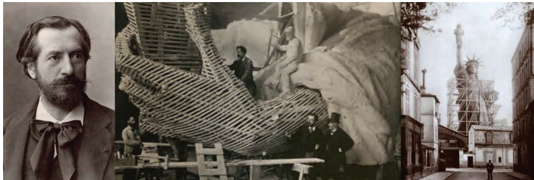
Frédéric Aguste Bartholdi – Construction of the Statue of Liberty from 1876 to 1884 in the Gaget and Gauthier foundry located, 25 Rue de Chauzelles in the 17th arrondissement of Paris

What a better symbol of the friendship between the American and French peoples than the Statue of Liberty overlooking New York harbor? This tall copper statue was a gift from the French citizens meant to celebrate the centennial of Independence Day, July 4th, 1776. The statue was conceived and built in the 17th arrondissement of Paris, shipped overseas in crates, assembled and erected on the completed pedestal on what was then called Bedloe's Island. The monument was finally dedicated with some delay on October 28th, 1886 by then President Grover Cleveland. Did you know that by coming to Alsace you are coming to the birthplace of its creator and sculptor Frédéric Auguste Bartholdi (1834-1904)?